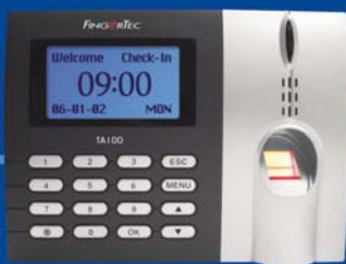
Model: TA102 / TA103